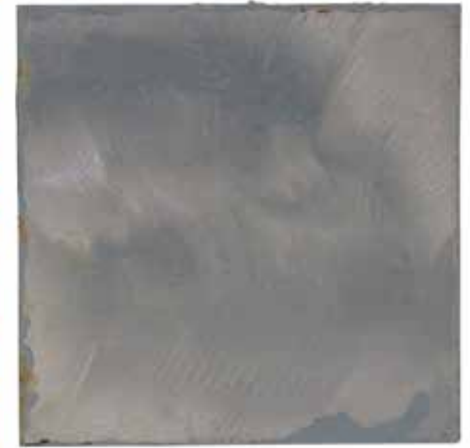
3M<sup>™</sup> Cavity Wax Plus 08852 (3 coats)